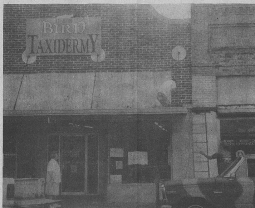
A sign of change